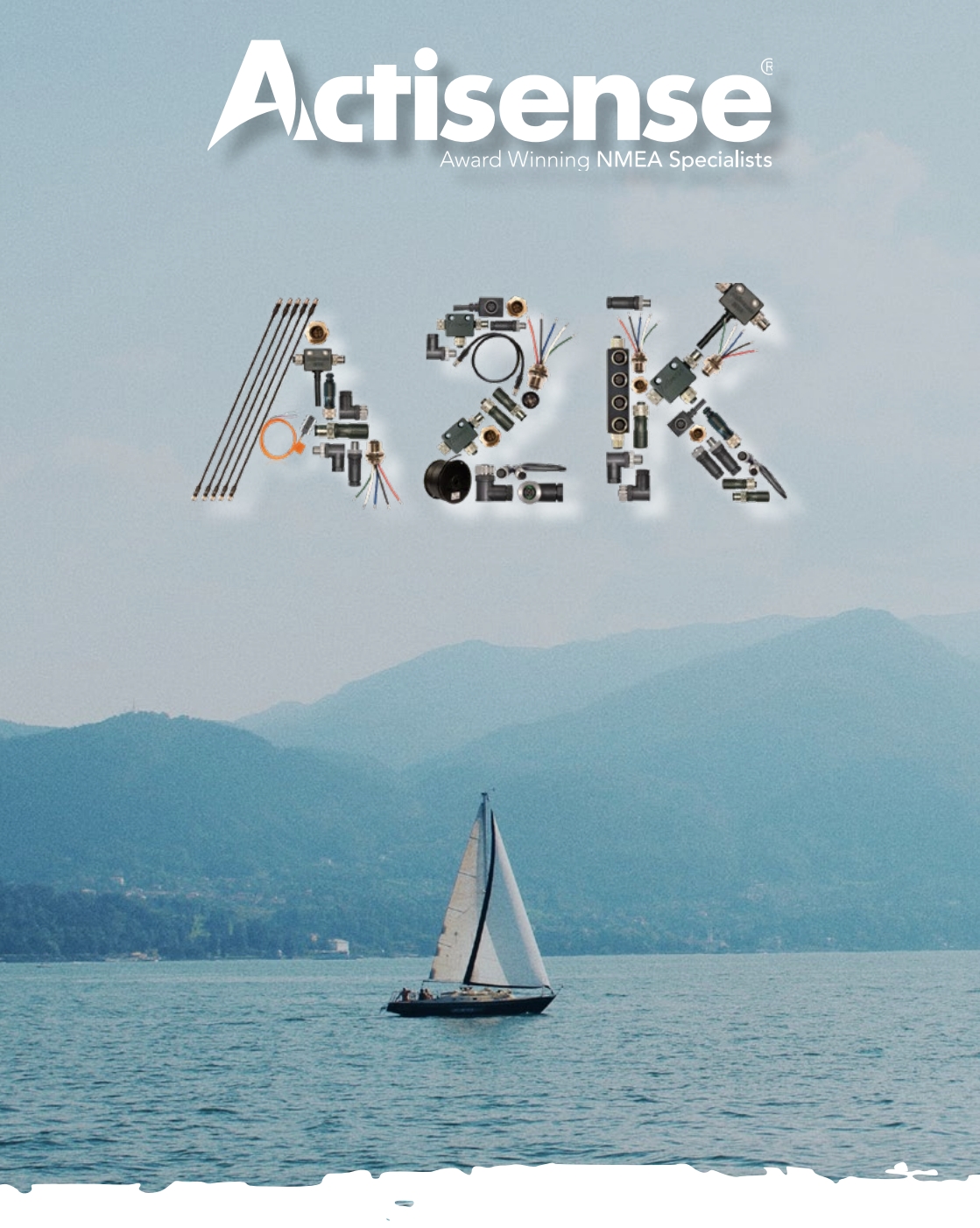
NMEA 2000® Cable & Connectors Product Catalogue