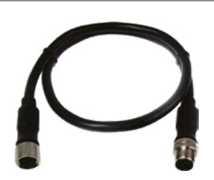
Dual Ended Cable