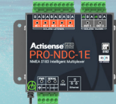
PRO-NDC-1E Intelligent Type Approved NMEA 0183 Multiplexer