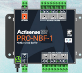
PRO-NBF-1 Type Approved NMEA 0183 Buffer