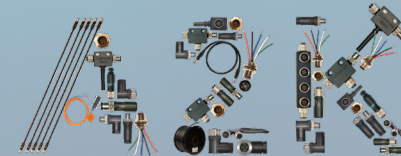
NMEA 2000® Network Range