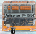
EMU-1 NMEA 2000® Engine Monitoring Unit