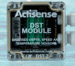
DST-2 Digital Depth, Speed & Temperature Transducer Interface