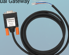
OPTO-4 Serial Opto Isolator