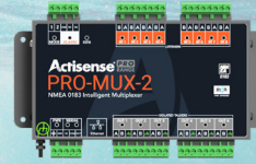
PRO-MUX-2 Professional NMEA 0183 Multiplexer